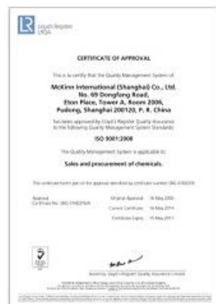
ISO 9001 Certificate (Shanghai, English)