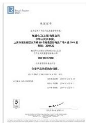
ISO9001 Certificate (Shanghai, Chinese)