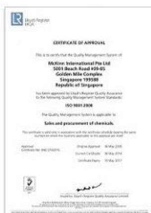
ISO9001 Certificate (Singapore)